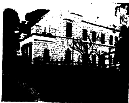
The Gaipur House.